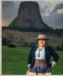
Dew Bad Warrior