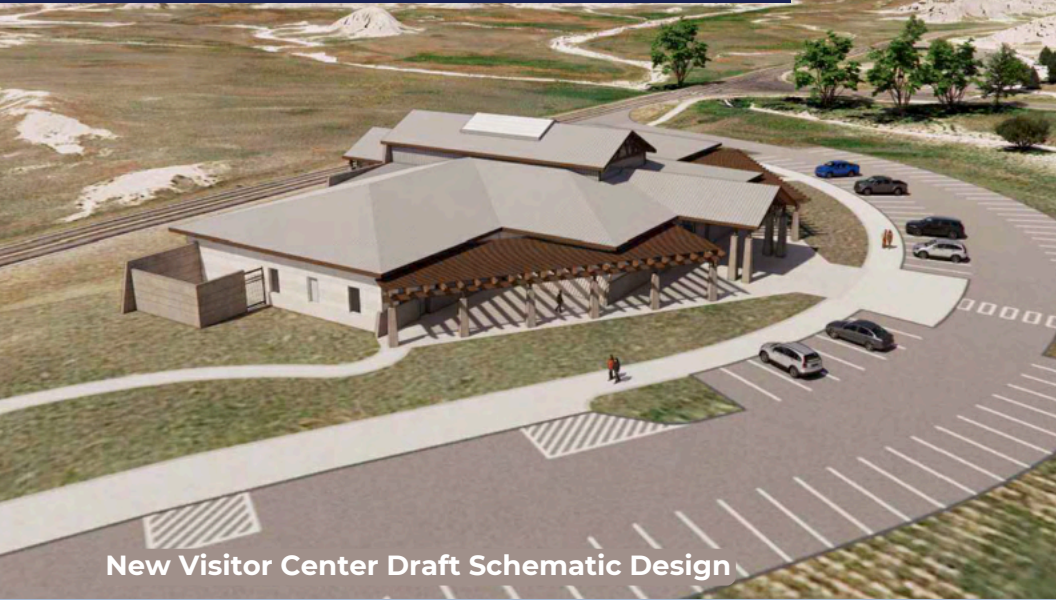
New Visitor Center Draft Schematic Design